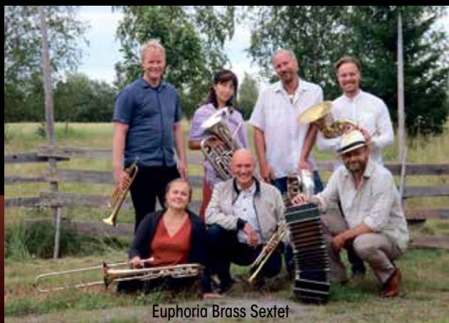
Euphoria Brass Sextet

Euphoria Brass Sextet public i daje euforično iskustvo, no jednako tako djeluje i na sebe dok izvode visokokvalitetnu glazbu. Repertoar pokriva glazbena razdoblja od romantike do moderne glazbe te ansambl stalno istražuje nova djela i nove zvukove bez ikakvih predrasuda. S obzirom da sekstet nije originalan sastav limenih puhača, gotovo su sva djela aranžirana ili napisana od strane članova. Ansambl je izdao nosač zvuka "Kun" s umjetnicom Emiliom Nyman, a publika nestrpljivo iščekuje novi projekt ansambla "Tango Nuevo" u suradnji s bandeonistom Henrikom Sandåsom.