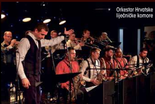
Orkestar Hrvatske liječničke komore

Big Band je do sada nastupao u klubovima Kontesa i Luda kuća u Zagrebu, Krapini, Bjelovaru, JazzVez festivalu u Đakovu, Vodice jazz&blues festivalu, Samobor jazz festivalu, Splitu (Splitke