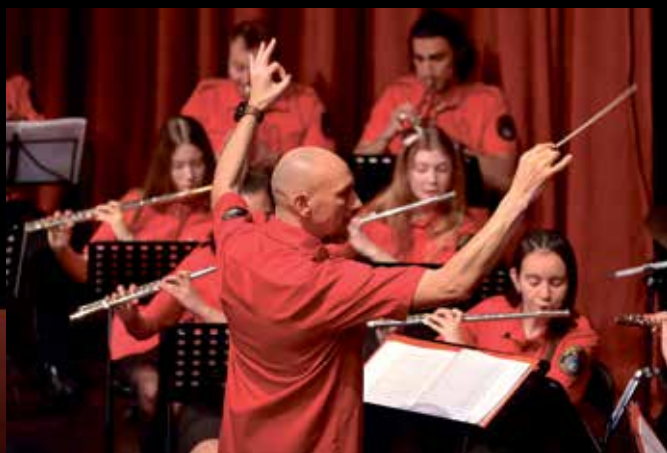
Orkestar DVD-a Velika Gorica