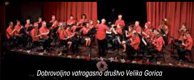
Dobrovoljno vatrogasno društvo Velika Gorica

DOBROVOLJNO VATROGASNO DRUŠTVO VELIKA GORICA osnovano je 1876. godine, što znači društvo djeluje 147 godina pod geslom „Vatru gasi – brata spasi!“. U sastavu društva davne 1930. godine osnovana je i limena glazba. Od tada ona se uključuje u obilježavanje svih značajnijih manifestacija u Velikoj Gorici i Turopolju. Sudjeluje na