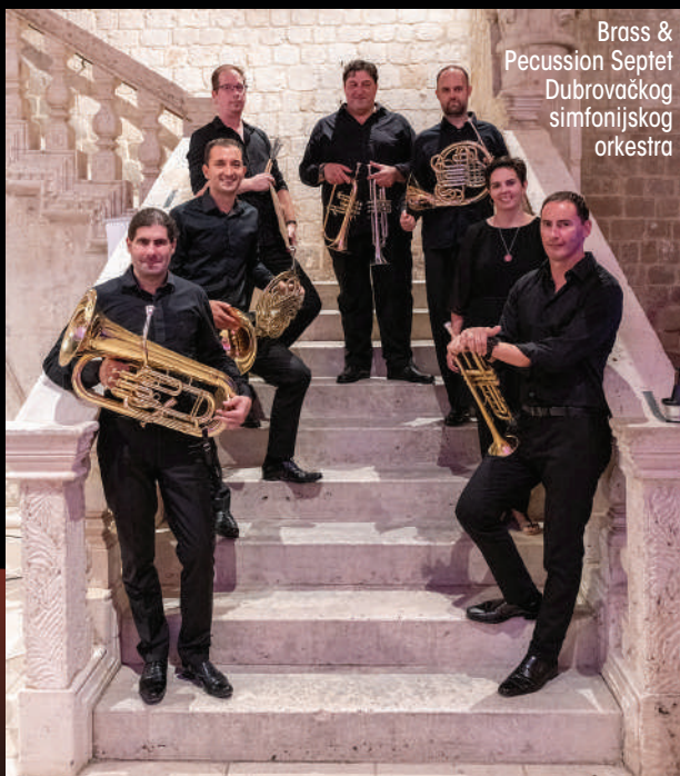
Brass & Pecussion Septet Dubrovačkog simfonijskog orkestra