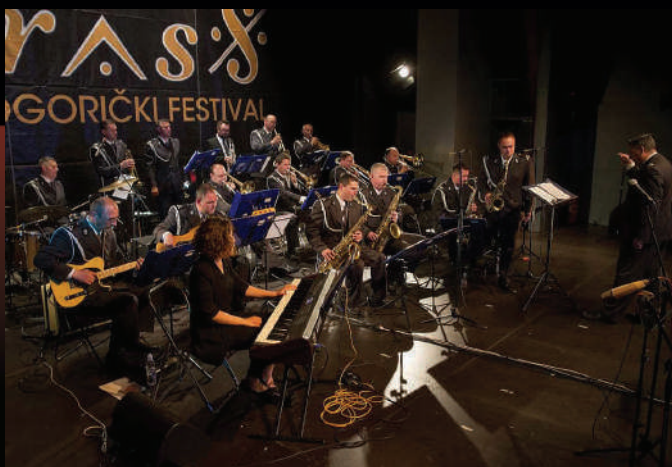
Jazz orkestar OSRH